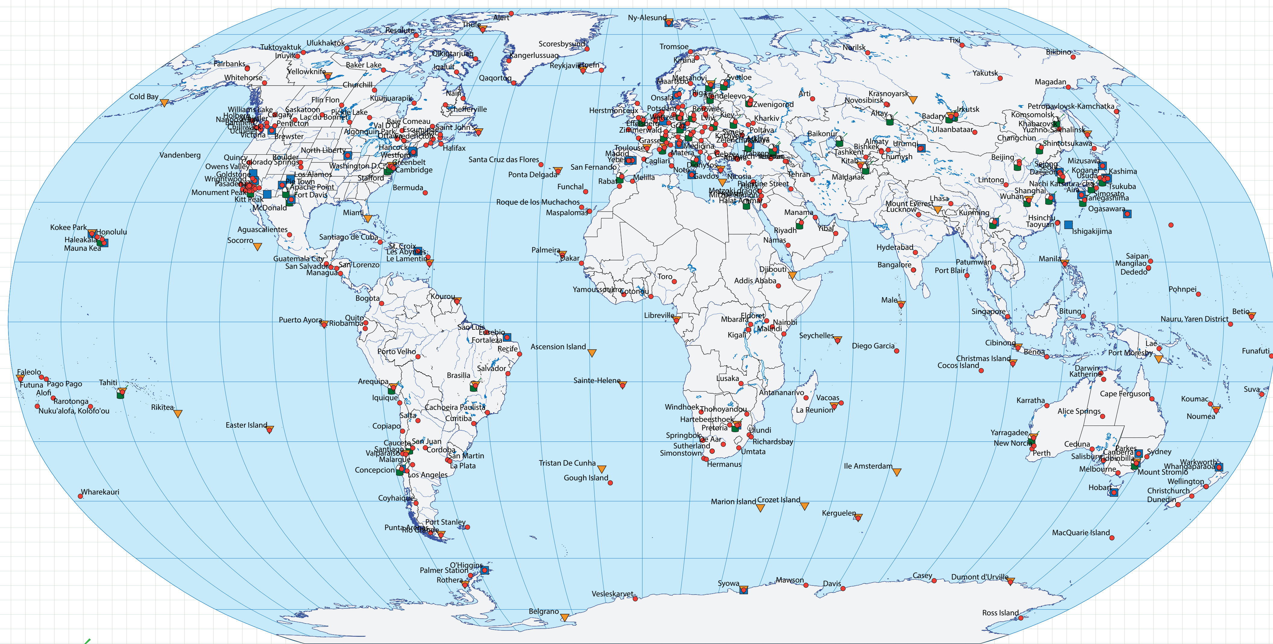
● ILRS (SLR) Network Site (42 sites) ● IGS (GNSS) Network Site (453 sites) ■ IVS (VLBI) Network/Cooperating Site (35/18 sites) ▼ IDS (DORIS) Network Site (58 sites)

NASA Goddard Space Flight Center, Greenbelt MD, USA